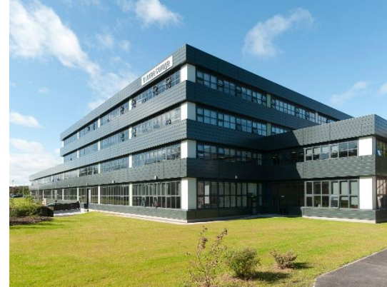
Gardyne Campus, Dundee